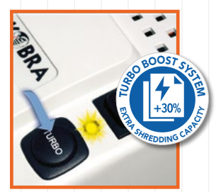
TURBO BOOST SYSTEM: by pressing the Turbo switch the shredding capacity of the machine is increased by 30%