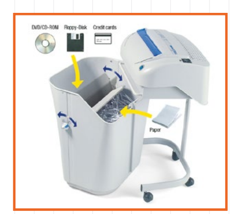
CONVENIENT REMOVABLE WASTE BIN for easy empty operations: does not require lifting of the cutting head. Equipped with a mechanism to separate shredded paper from plastic shreds. ECO-FRIENDLY: does not require plastic bags.